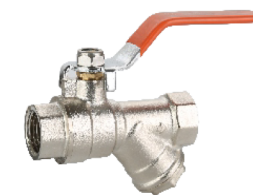
Ball Valve With Filter