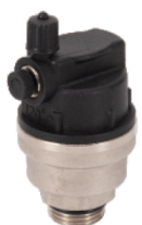
Bottle Air Vent