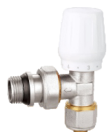
Thermostatic Radiator Valve