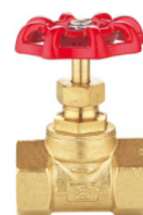
Brass Gate Valve