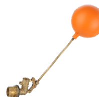
Float Ball Valve